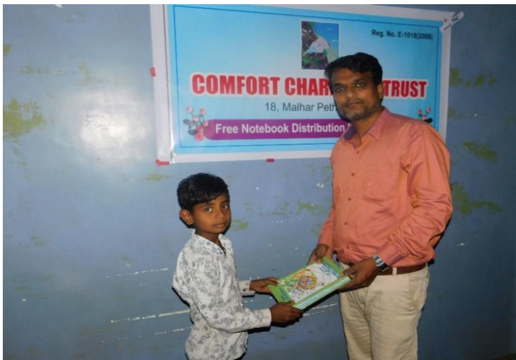
Free Note Book Distribution Free Notebook Distributions at Sadar Bazar dist. Satara