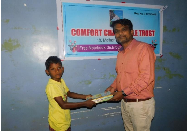
Free Note Book Distribution Free Notebook Distributions at Sadar Bazar dist. Satara