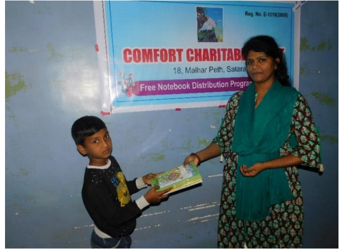
Free Note Book Distribution Free Notebook Distributions at Sadar Bazar dist. Satara