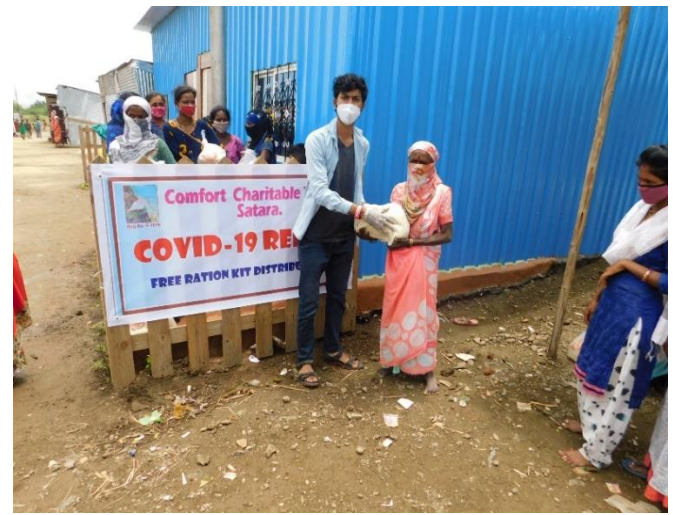
Free Note Book Distribution Free Notebook Distributions at Sadar Bazar dist. Satara