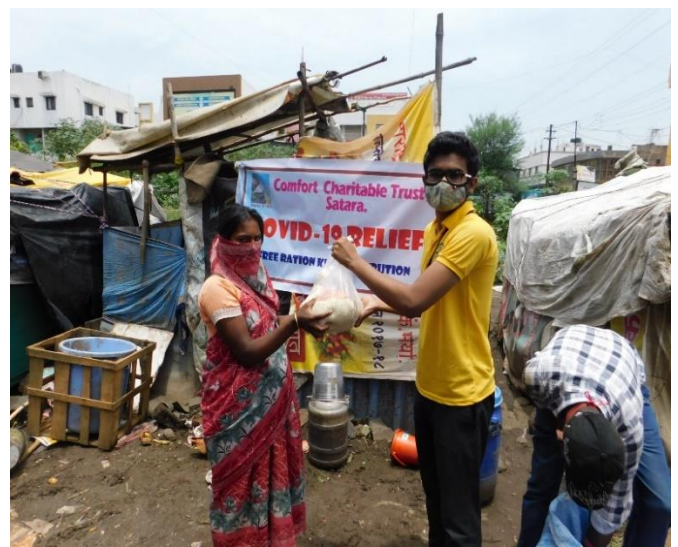
Covid – 19 Relief Program Grain Distributions at Satara dist. Satara