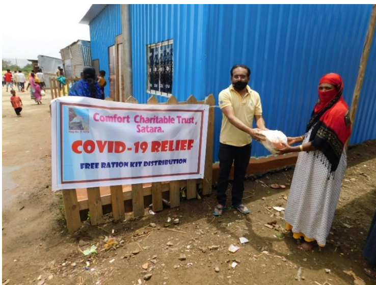
Covid – 19 Relief Program Grain Distributions at Satara dist. Satara