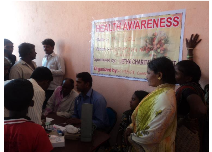
Free Medical Camp Pratapsingnagar dist. Satara