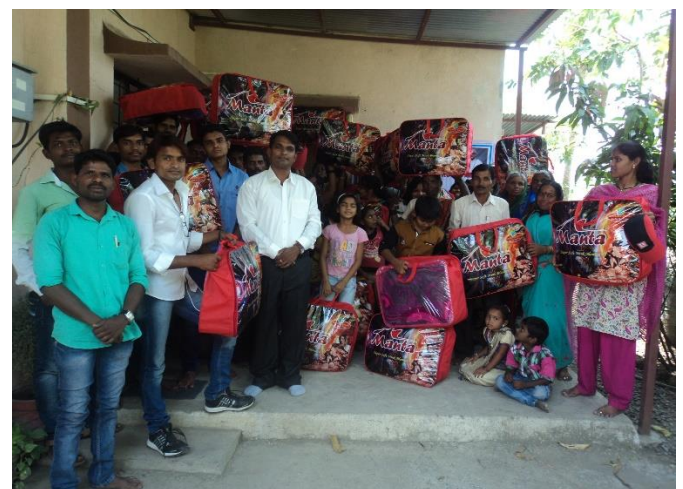
Free Blanket Distribution Program Blanket Distributions at Satara dist. Satara