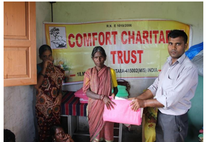
Free Mosquito Net Distribution Free Mosquito Net Distributions at Sadar Bazar dist. Satara