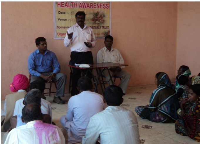
Free Medical Camp Pratapsingnagar dist. Satara