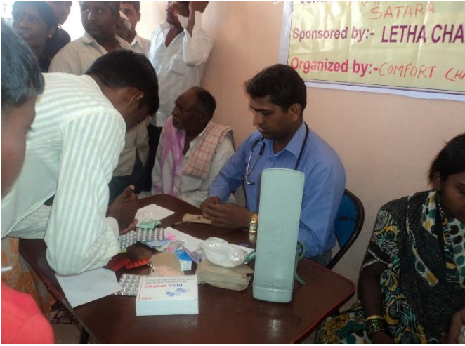
Free Medical Camp Pratapsingnagar dist. Satara