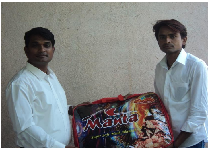
Free Blanket Distribution Program Blanket Distributions at Satara dist. Satara